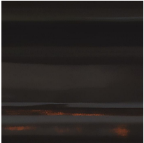
Ferré black lacquered