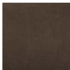
Dark Brown Saddle Leather