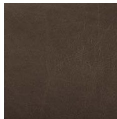
Dark Brown Saddle Leather