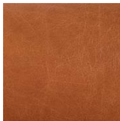
Tan Saddle Leather