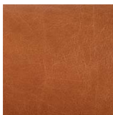
Tan Saddle Leather