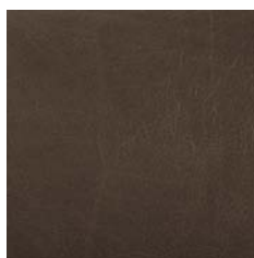
Dark Brown Saddle Leather