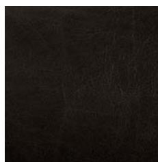
Black Saddle Leather