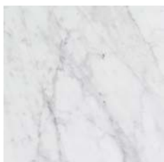
Bianco Carrara marble