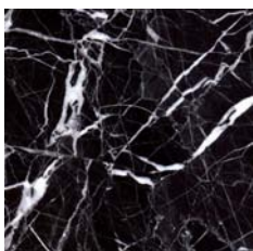
Black Marquinia marble