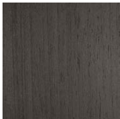
Tay Veneered Dyed Smokey Grey