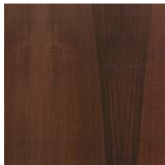
Canaletto Walnut Veneered